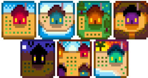
(different types of farms you can choose when start the game)